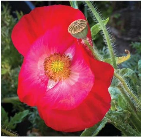
01-A Poppy Variation.jpg