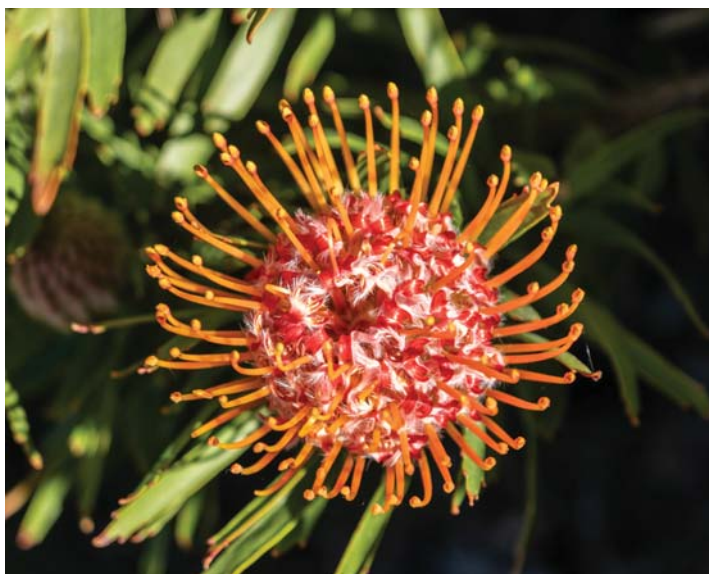
Leucospermum Dick Light