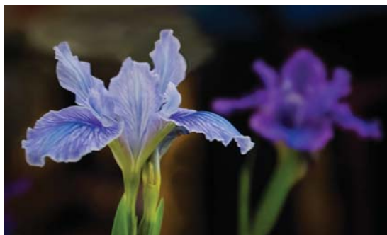
03-Blue Iris - Iris douglasiana.jpg